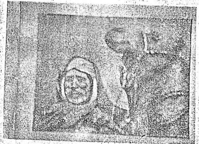
Priscilla painted this Arab and his camel during their year's stay in Libya.

The second year they moved to a heated apartment outside London, across the street from the Henry VIII park, and were much more comfortable. They traveled in the summers to Scotland, Wales, Germany, Sweden, Holland, Belgium -- seeing as much as they could of Europe -- "even though we had only $3 a day for meals for 5 of us!"